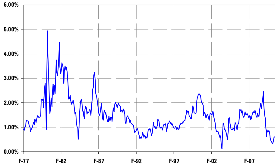
30-Year Mortgage Rate % Spread Over 30-U.S. Treasury Bond Yield Through October, 2010

Current 30-year mortgage rate of 4.23% represents a 0.36% premium, compared to 1.50% average premium since 1977, to the U.S. government's cost of borrowing money for 30 years.